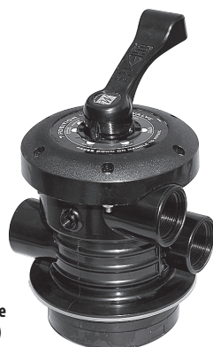
Collar Style (WVS002)