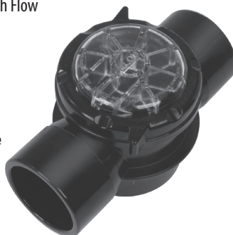
3" TruSeal Check Valve 600-0111