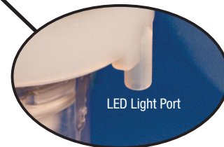
LED Light Port

Our SGMS LED light ports allow the top side controls to be brilliantly lit without requiring further components.