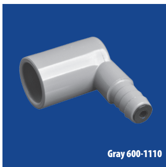
90° ELBOW (Check Valve) 1/2" SPG x 3/8" RB