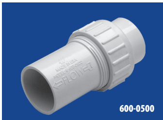
UNIONIZED CHECK VALVE (1/4 LB. SPRING) 1 1/2" S x 1 1/2" S