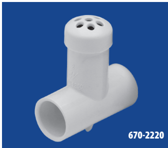
1/2" S TEE NEOPERL CHECK VALVE WITH CAP/FOAM