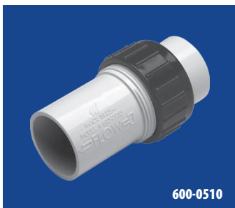
UNIONIZED CHECK VALVE (3/32 LB. SPRING) 1 1/2" S x 1 1/2" S