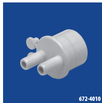
MANIFOLD 1" SPG x (2) 3/8" SB