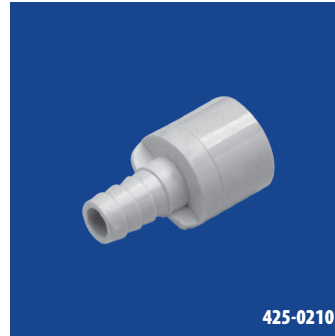
STRAIGHT ADAPTER 1/2" SPG x 3/8" RB