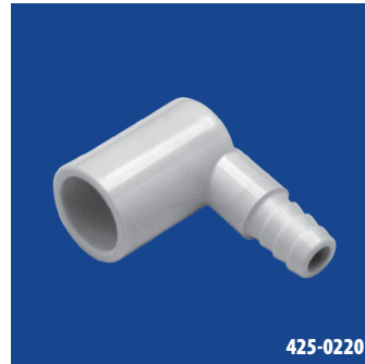
90° ADAPTER 1/2" SPG x 3/8" RB