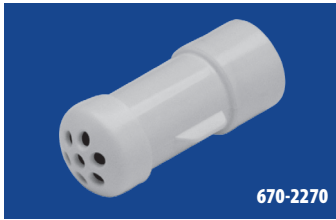
1/2" S NEOPERL CHECK VALVE WITH CAP/FOAM