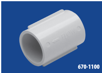
1" CHECK VALVE WITH DIAPHRAGM