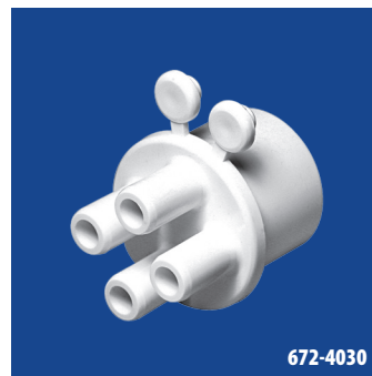
MANIFOLD 1" SPG x (4) 3/8" SB