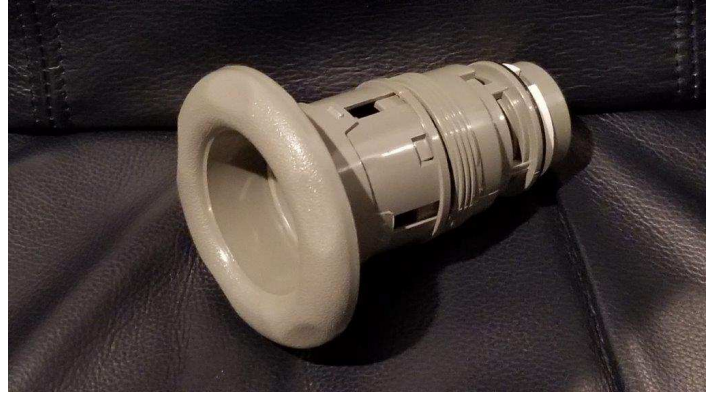
Escutcheon Extended completely