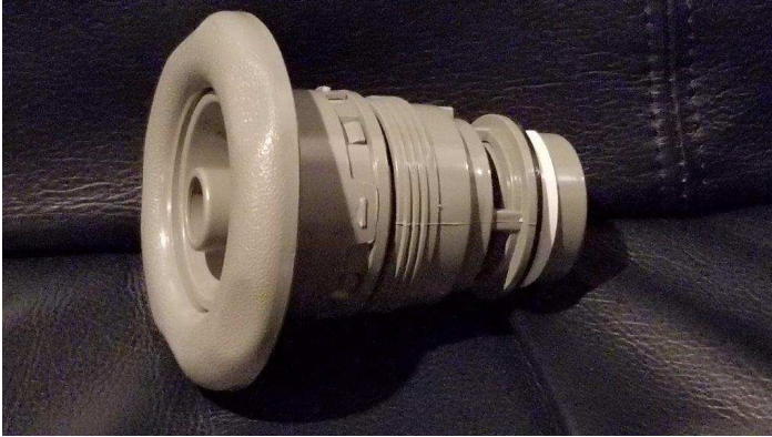
Original Deluxe Poly Jet Internal