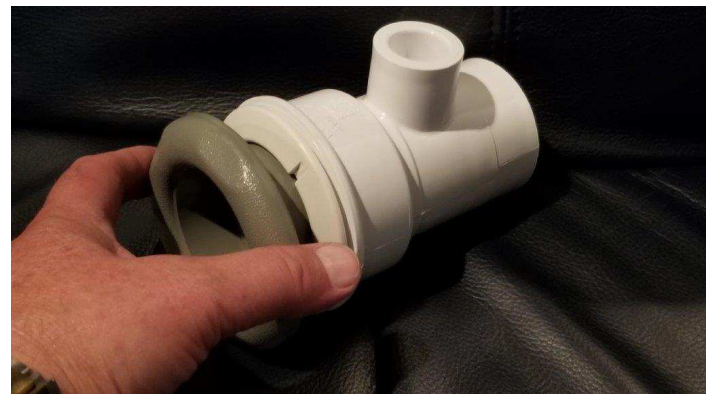
Hold Escutcheon and continue to thread barrel until snug