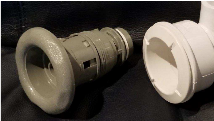
Escutcheon Extended ready to install into the Body