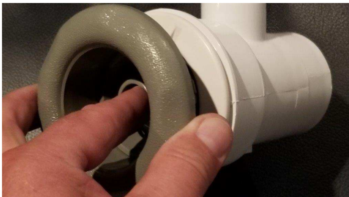
Hold Escutcheon out and push barrel into the Body. With Escutcheon thread barrel into Body