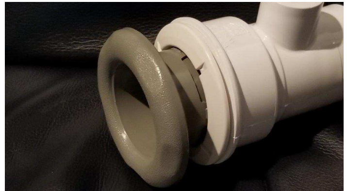
Inserted into Body