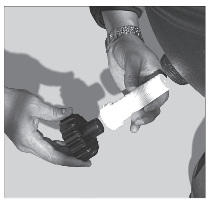
6. To remove drain screen, remove drain screen cap/wrench and using the wrench end, insert into drain screen opening and unscrew. When reinserting drain screen DO NOT OVER TIGHTEN (be sure 0-ring is inside of drain cap). Screw on drain screen cap/wrench. DO NOT OVER TIGHTEN.