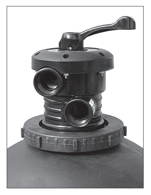
5 . Split-nut is fully installed when threads on body are not exposed. Retighten bolt on split-nut after installation to ensure valve is not loose.